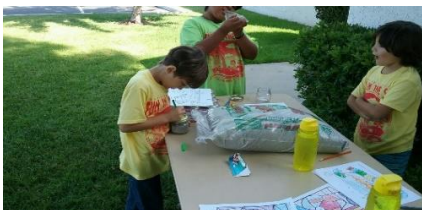
Cub Scouts at Cub Scout Day Camp

I would like to thank all the staff and participants for making Cub Scout Day Camp, my last as Director, a success.