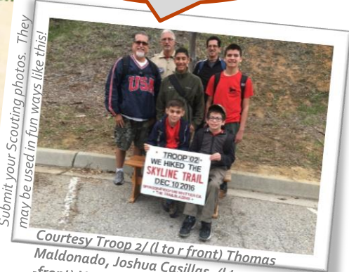
Submit your Scouting photos. They may be used in fun ways like this!

Hey! We've been hiking for miles...is this the way to the Roundtable?