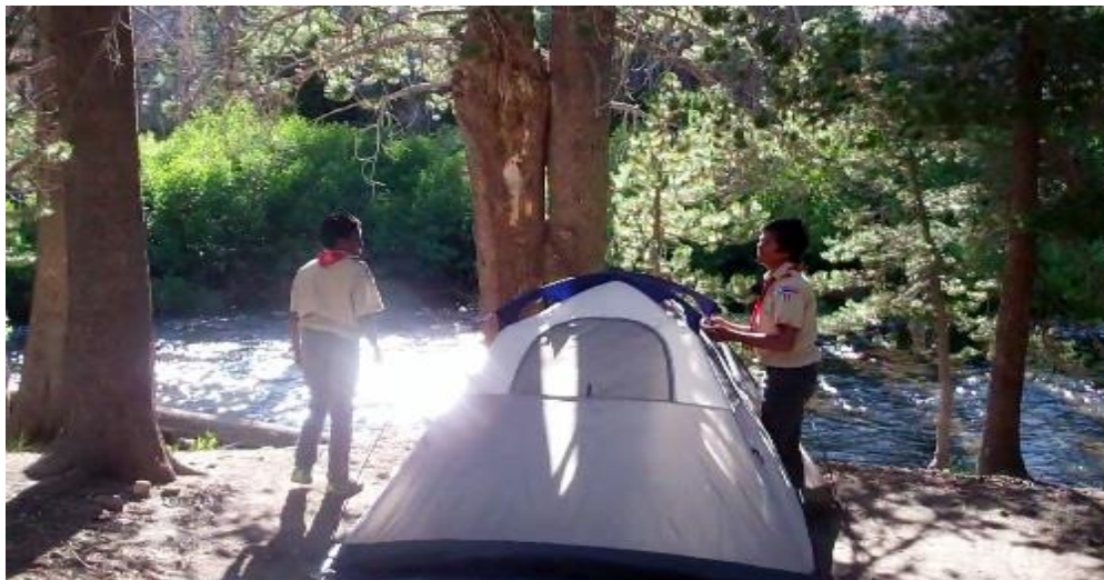
Submit your Scouting photos. They may be featured in the next e- newsletter.